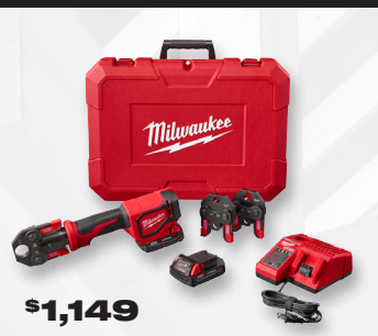
M18<sup>™</sup> Short Throw Press Tool Kit w/ PEX Crimp Jaws (2674-220)

$4,898 M18<sup>™</sup> FORCE LOGIC<sup>™</sup> Long Throw Press Tool Kit (2773-20L)